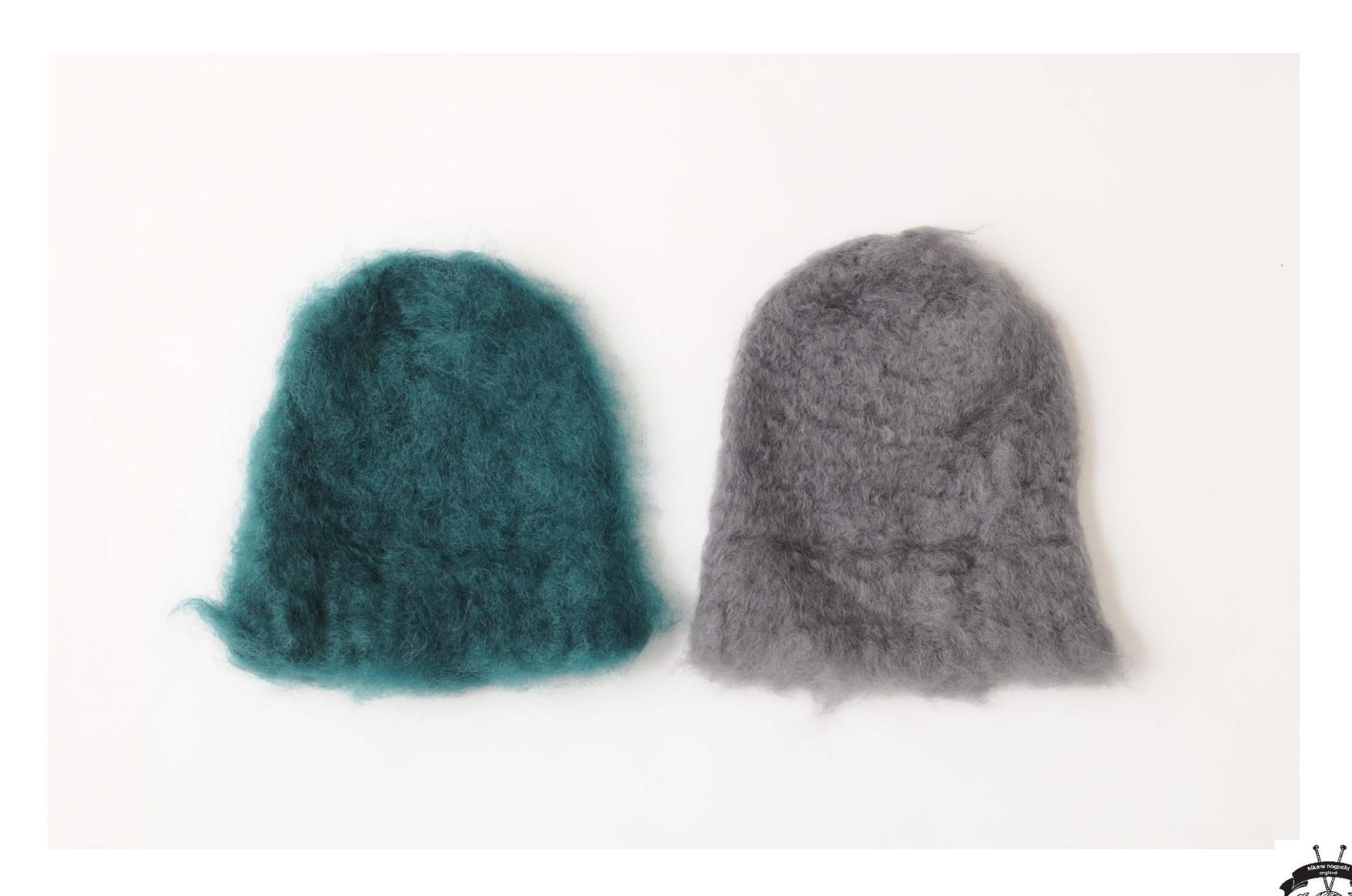
FLUFFY MOHAIR HAT - KNITTED IN SOUTH AFRICA