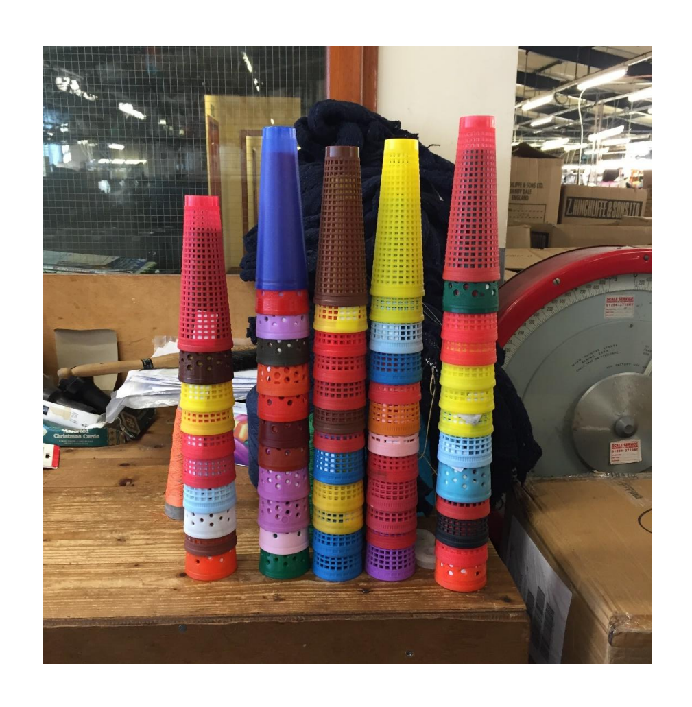
SCOTISH KNITTING MILL