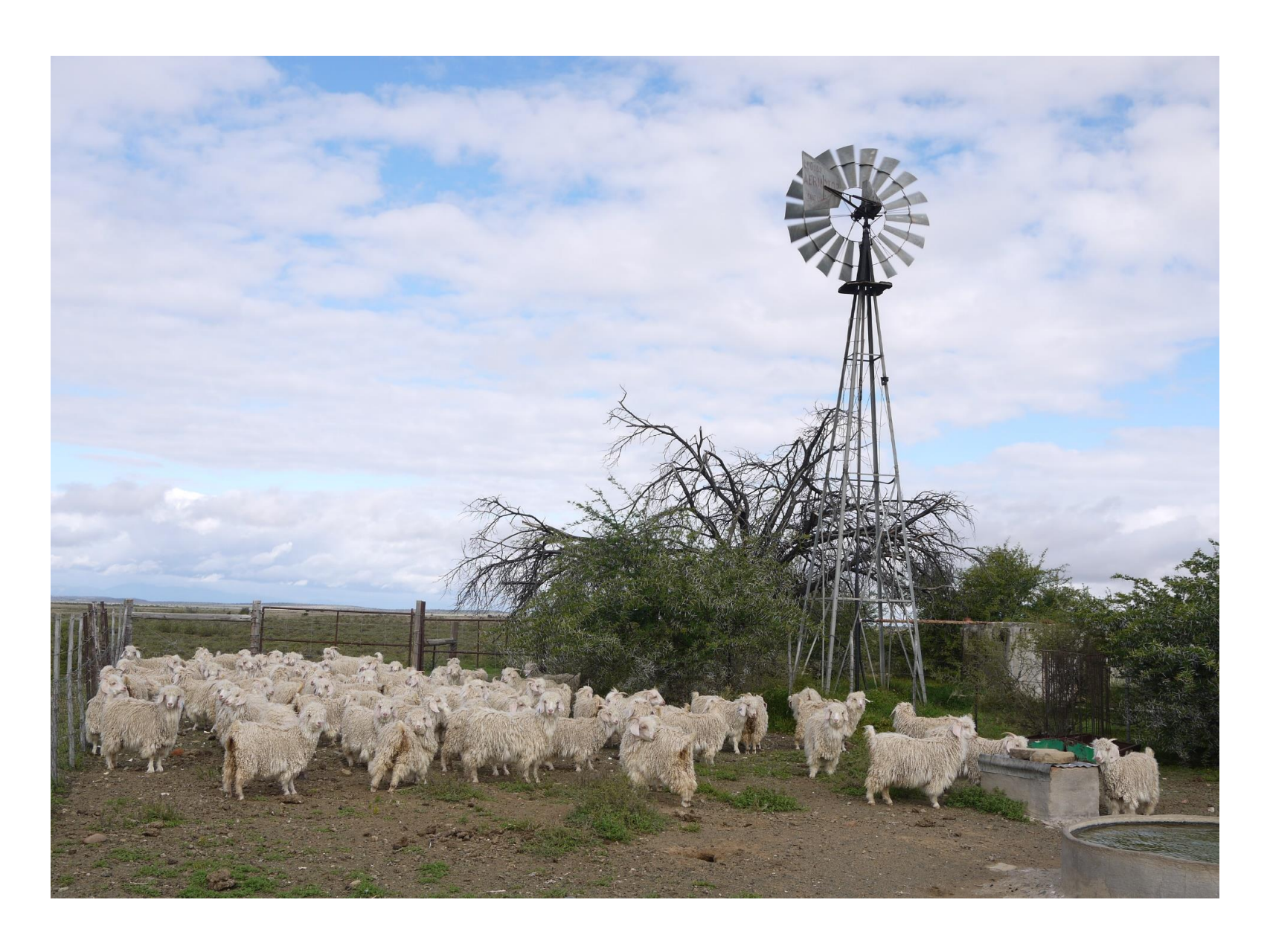
SOUTH AFRICAN MOHAIR, DIAMOND FIBRE FOR KNITTING